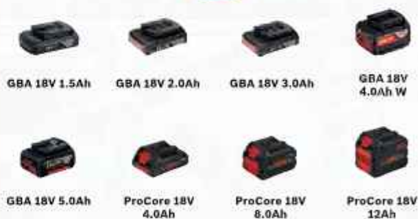
GBA 18V 1.5Ah GBA 18V 2.0Ah GBA 18V 3.0Ah GBA 18V 4.0Ah W GBA 18V 5.0Ah ProCore 18V 4.0Ah ProCore 18V 8.0Ah ProCore 18V 12Ah