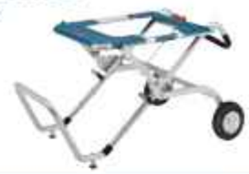
Table saw stand for ultimate mobility